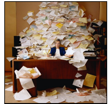
Americans receive hundreds of financial documents a year, but do not know when it's safe to destroy them.

Consumer Reports® recommends that you dispose of bank deposit slips after you've reconciled your statements. Bank account statements can usually be destroyed after a calendar year, unless they are needed to support a tax deduction, in which case retain them with your tax records for 7 years. Receipts are much the same, keeping them until the warranty expires or if needed to support tax deductions, 7 years. Credit card bills can also be disposed of after you've checked them, or after 7 years if