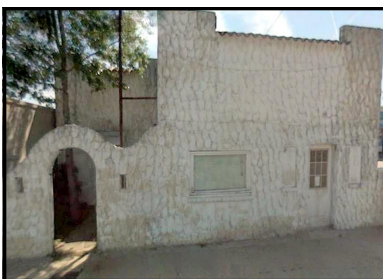
The firm's second office in Historic Downtown Dunnellon.

food which is sent to schools in developing countries around the world, with the hope that children will come to school to get a meal. In last year's effort, we packaged over 50,000 meals, and this year our goal is to double it. Every donation allows more meals to be provided for these children in need. For every 25¢ donated, another meal is packaged. To volunteer your time or make a tax-deductible donation, please contact our office.