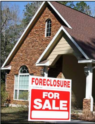
Many Americans face the difficult process of foreclosure every day, but you don't have to do it alone.

Florida's foreclosure crisis has been driving down the state's economy for 4 years, pulling down home values and sinking family finances. While foreclosure filings are down in 2011, Florida is still ranking second in the country, only behind California.